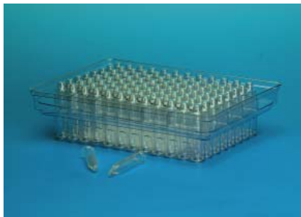
4035FT-632VL 350µL Glass Conical Pulled Point Insert with Flange, 6x32mm, in Vial Loader