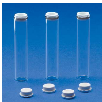
Molded individual plugs allow limited sample testing