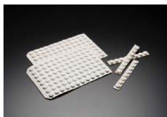
Molded mats and strips seal individual vials to isolate samples