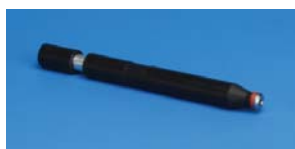
Vial Remover Tool