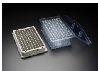
Vial loader is fast and convenient for loading vials into the base plate