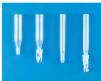
402P-536, 402PBS-536, 4025P-631, 402PBS-536