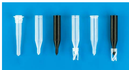
401PTS-530, 4025P-631, 4025P-631BK, 4025PBS-631, 4025PF-631, 425PBS-631BK