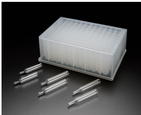
System uses 96 glass tapered inserts in a 96-square deep well plate.

An ideal solution for sample storage, reactive chemistry and biological testing.