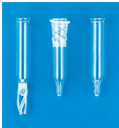
403BS-638X, 403TS-638, 403-638X

All Glass Inserts are available Silanized.